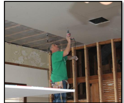
Progress being made on main floor

Mail your check (with SBCC on the memo line) to Bedford Historical Society at 24 North Amherst Road, Bedford, NH 03110.